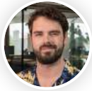
Stijn van Wonderen