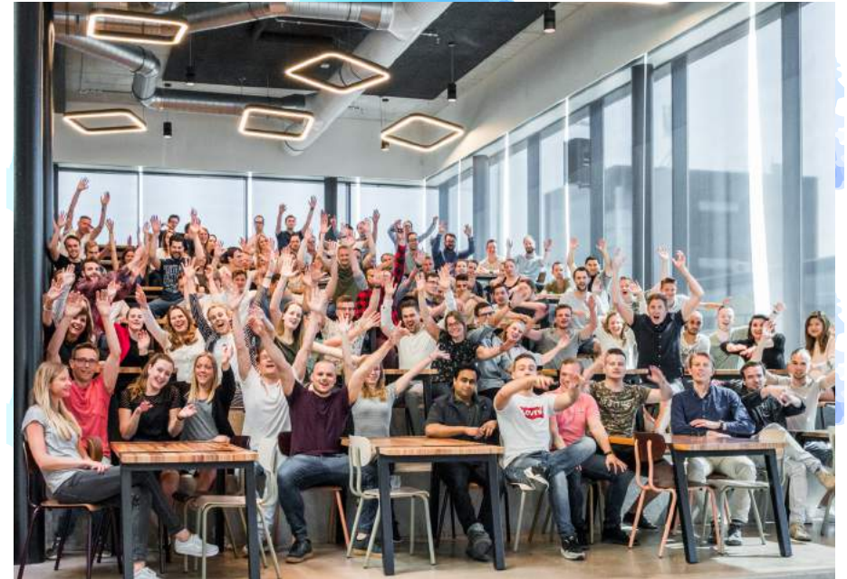
Greetings from the team!