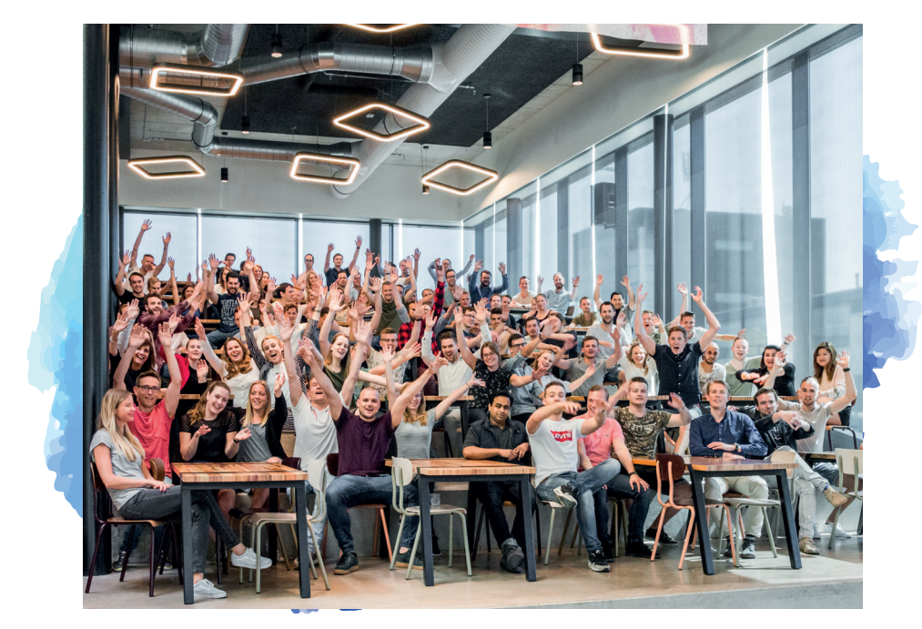
Greetings from the team!